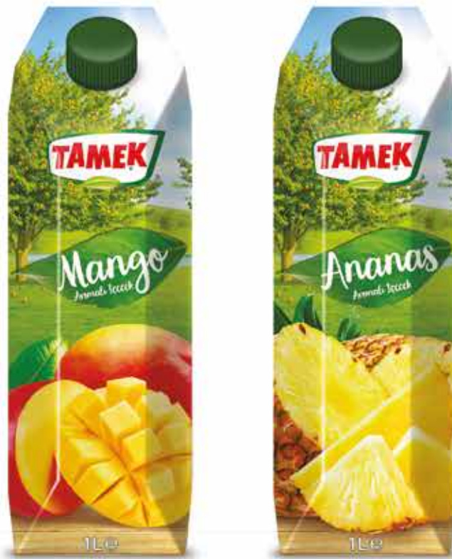
MANGO FLAVOURED DRINK PINEAPPLE FLAVOURED DRINK