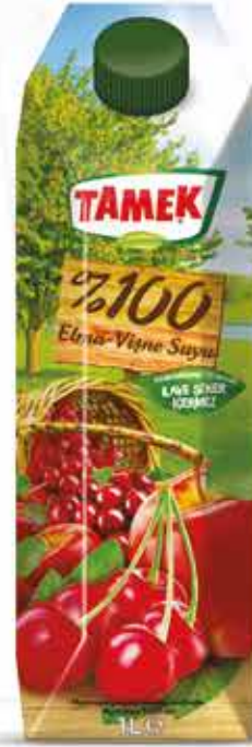
100% APPLE- SOUR CHERRY JUICE