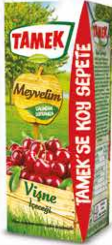
SOUR CHERRY DRINK