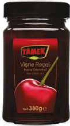
380 g SOUR CHERRY JAM