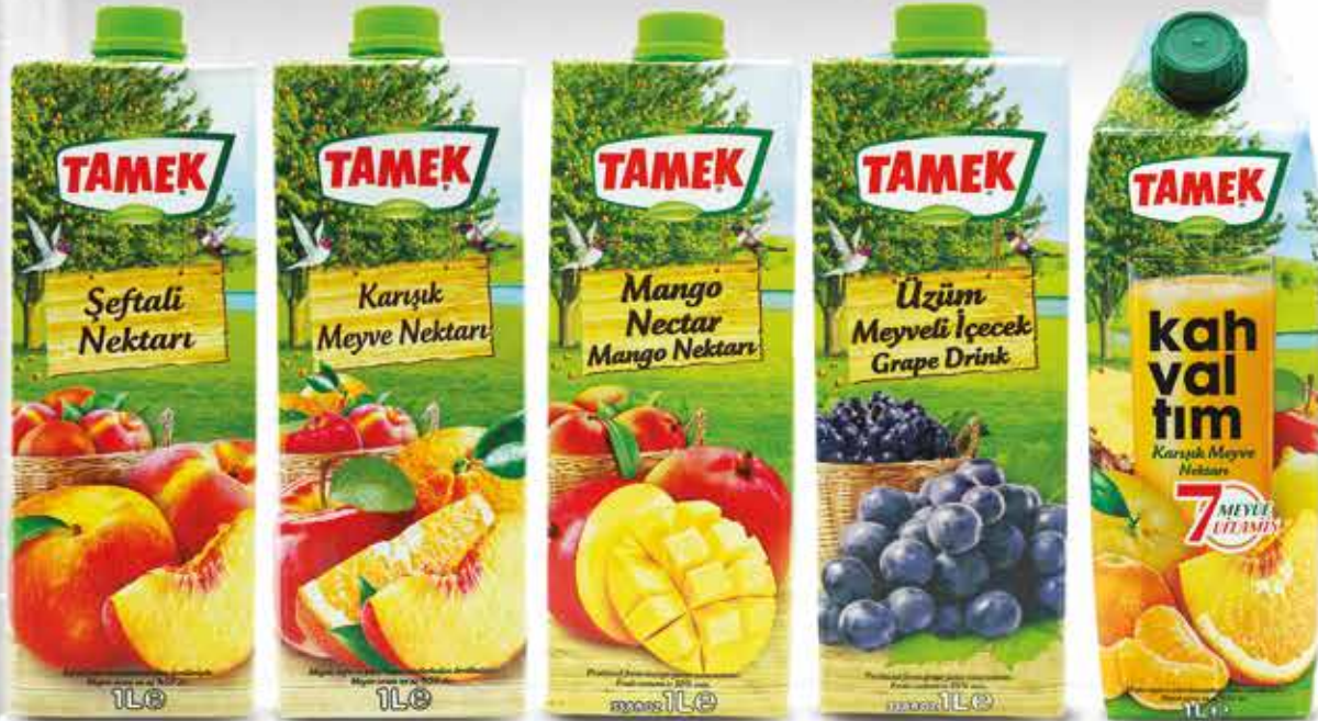
PEACH NECTAR MULTI FRUIT NECTAR MANGO NECTAR GRAPE NECTAR 7 FRUITS 7 VITAMINS MULTI FRUIT NECTAR