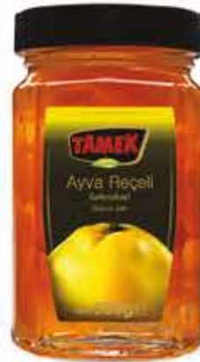
380 g QUINCE JAM