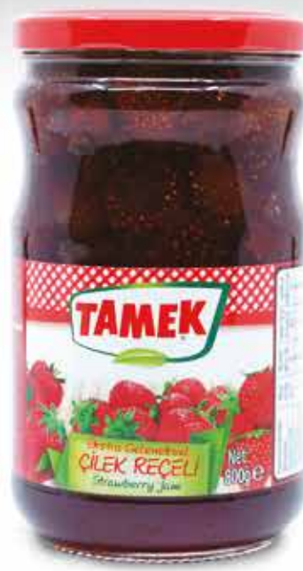
800 g STRAWBERRY JAM