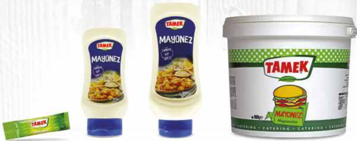
9 g MAYONNAISE