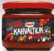
300 g HOT PEPPER SAUCE