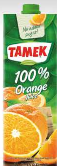
100% ORANGE JUICE