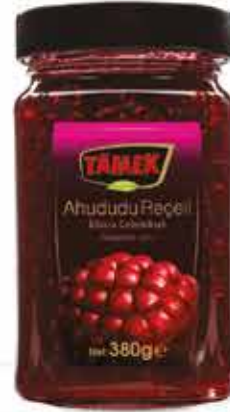
380 g RASPBERRY JAM