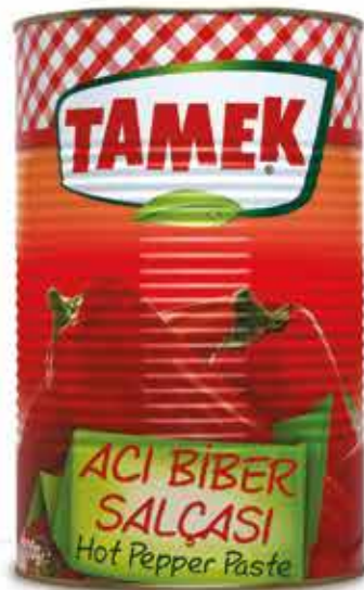
4300 g HOT PEPPER PASTE