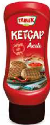
650 g HOT KETCHUP