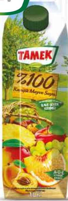
100% MULTI FRUIT JUICE