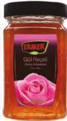
380 g ROSE JAM