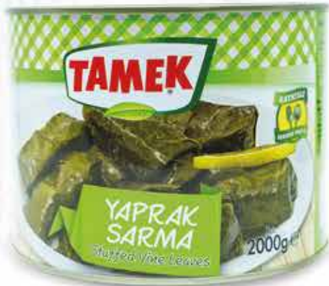
2000 g STUFFED VINE LEAVES