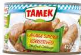
400 g STUFFED CABBAGE