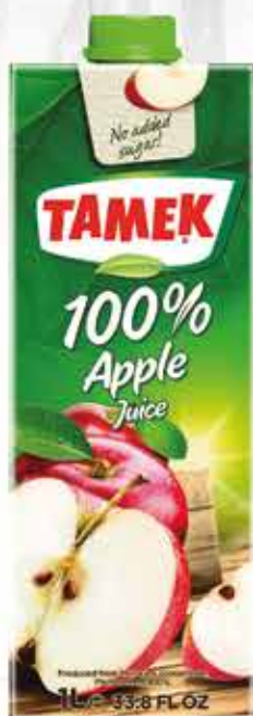
100% APPLE JUICE