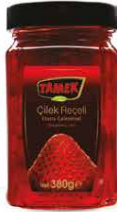
380 g STRAWBERRY JAM