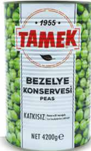
4200 g GREEN PEAS