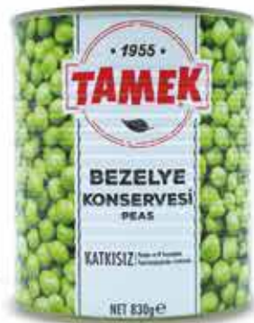
830 g GREEN PEAS