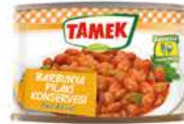
400 g RED BEANS IN TOMATO SAUCE