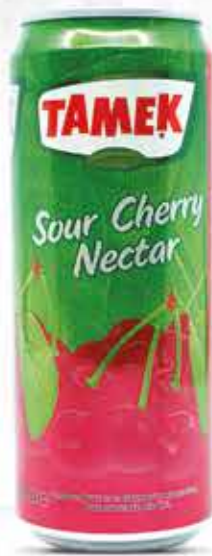
SOUR CHERRY NECTAR