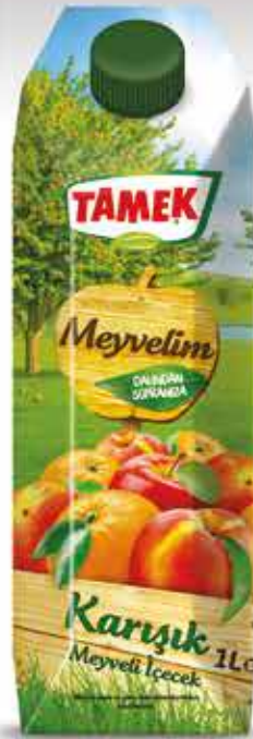
MULTI FRUIT DRINK