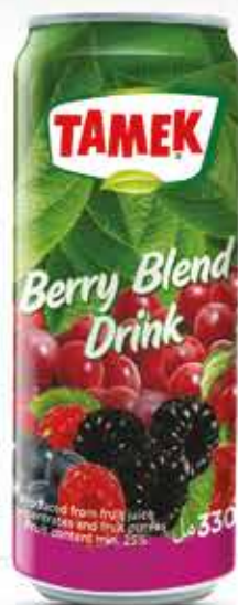
BERRY BLEND DRINK