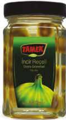
380 g FIG JAM