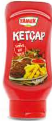
400 g KETCHUP