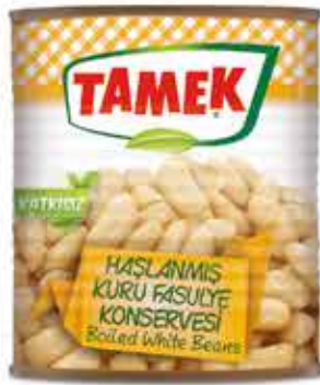
800 g BOILED WHITE BEANS