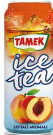
ICE TEA PEACH