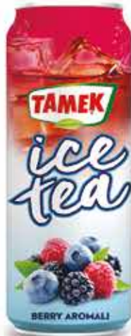
ICE TEA BERRY