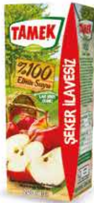
100% APPLE JUICE