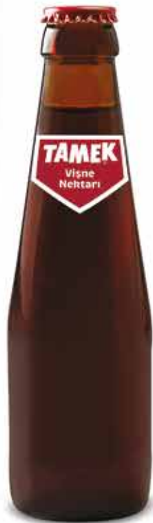
SOUR CHERRY NECTAR