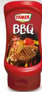
240 g BARBECUE SAUCE