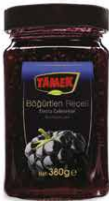
380 g BLACKBERRY JAM