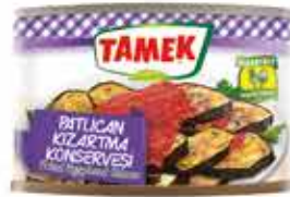
380 g FRIED EGGPLANT SLICES