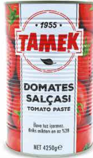
4250g TOMATO PASTE