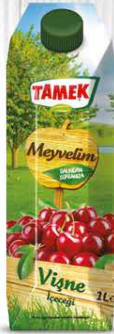
SOUR CHERRY DRINK