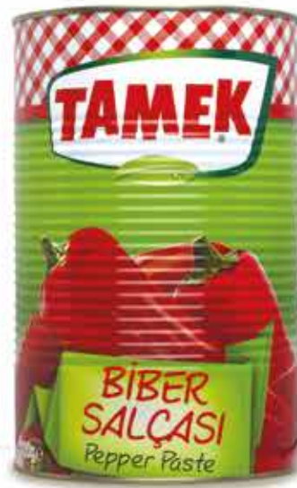
4300 g PEPPER PASTE