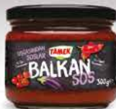
300 g LUTENITSA