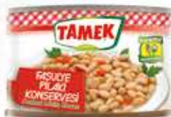
400 g WHITE BEANS IN TOMATO SAUCE