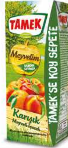
MULTI FRUIT DRINK