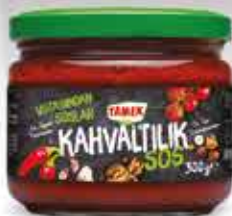
300 g PEPPER SAUCE