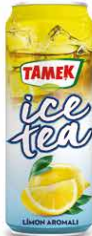
ICE TEA LEMON