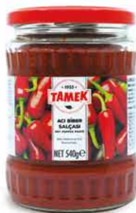
540 g HOT PEPPER PASTE