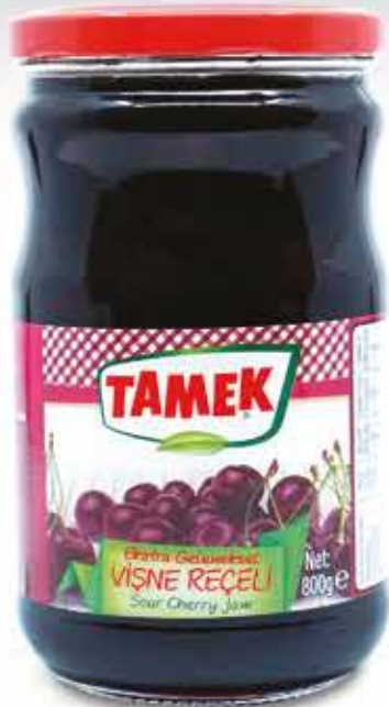
800 g SOUR CHERRY JAM