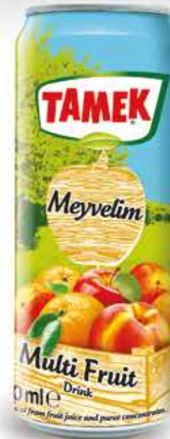
MULTI FRUIT DRINK