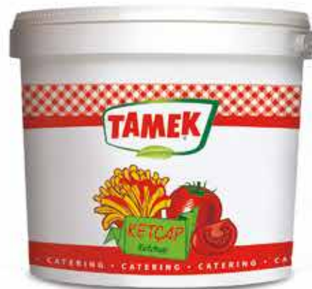
9000 g KETCHUP