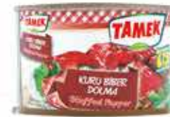
400 g STUFFED PEPPER