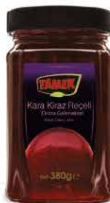
380 g BLACK CHERRY JAM