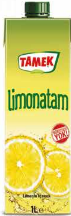
LEMON FRUIT DRINK