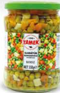
550 g GARNITURE