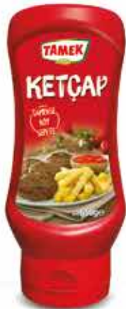
650 g KETCHUP