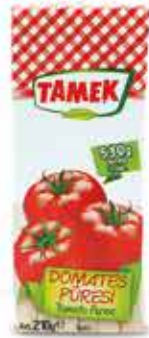
210 g TOMATO PUREE