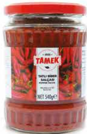
540 g PEPPER PASTE