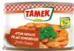
400 g JUMBO BEANS