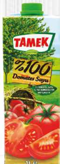
100% TOMATO JUICE