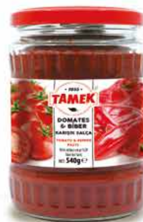
540 g TOMATO- PEPPER PASTE