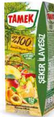
100% MULTI FRUIT JUICE