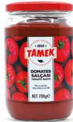
700 g TOMATO PASTE