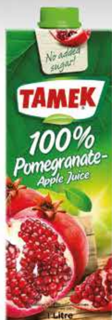
100% POMEGRANATE-APPLE * JUICE