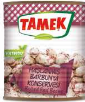
800 g BOILED RED BEANS