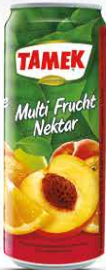
MULTI FRUIT NECTAR