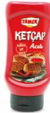
400 g HOT KETCHUP