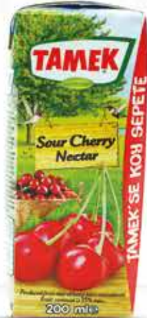
SOUR CHERRY NECTAR