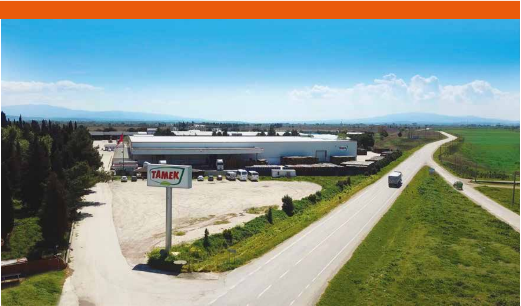
TAMEK Karacabey Factory