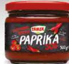
300 g PAPRIKA HOT PEPPER SAUCE