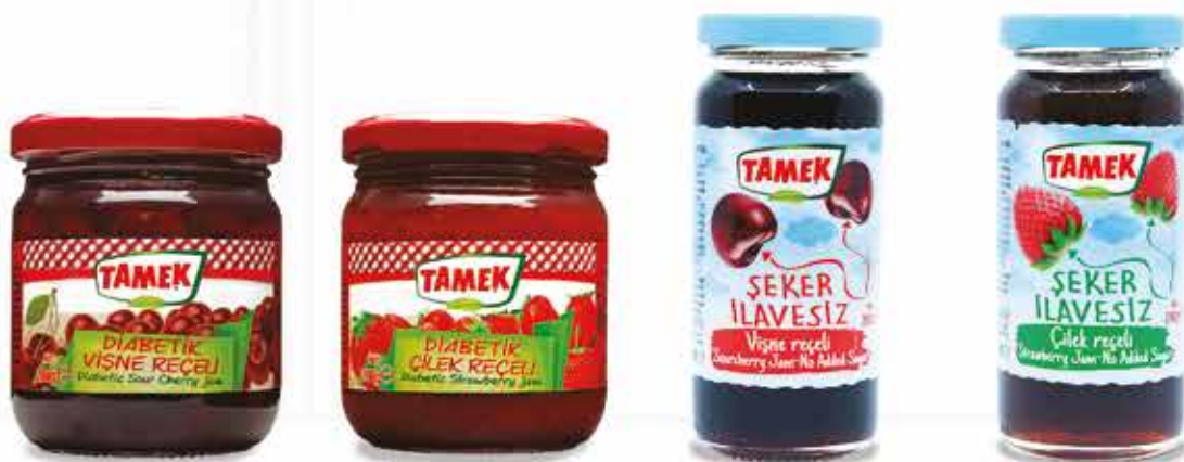
200 g DIABETIC SOUR CHERRY JAM