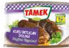
400 g STUFFED EGGPLANT