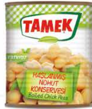
800 g BOILED CHICK PEAS