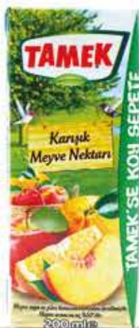
MULTI FRUIT NECTAR