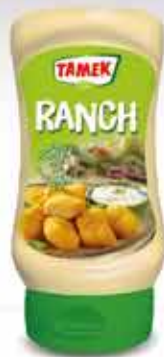
240 g RANCH SAUCE