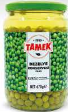
670 g GREEN PEAS