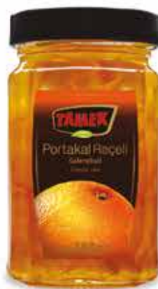
380 g ORANGE JAM