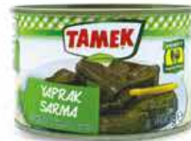
400 g STUFFED VINE LEAVES