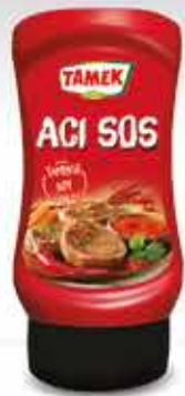
250 g HOT SAUCE