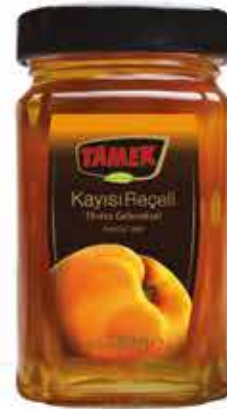
380 g APRICOT JAM