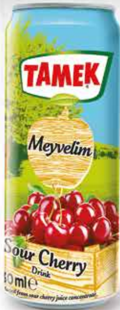
SOUR CHERRY DRINK