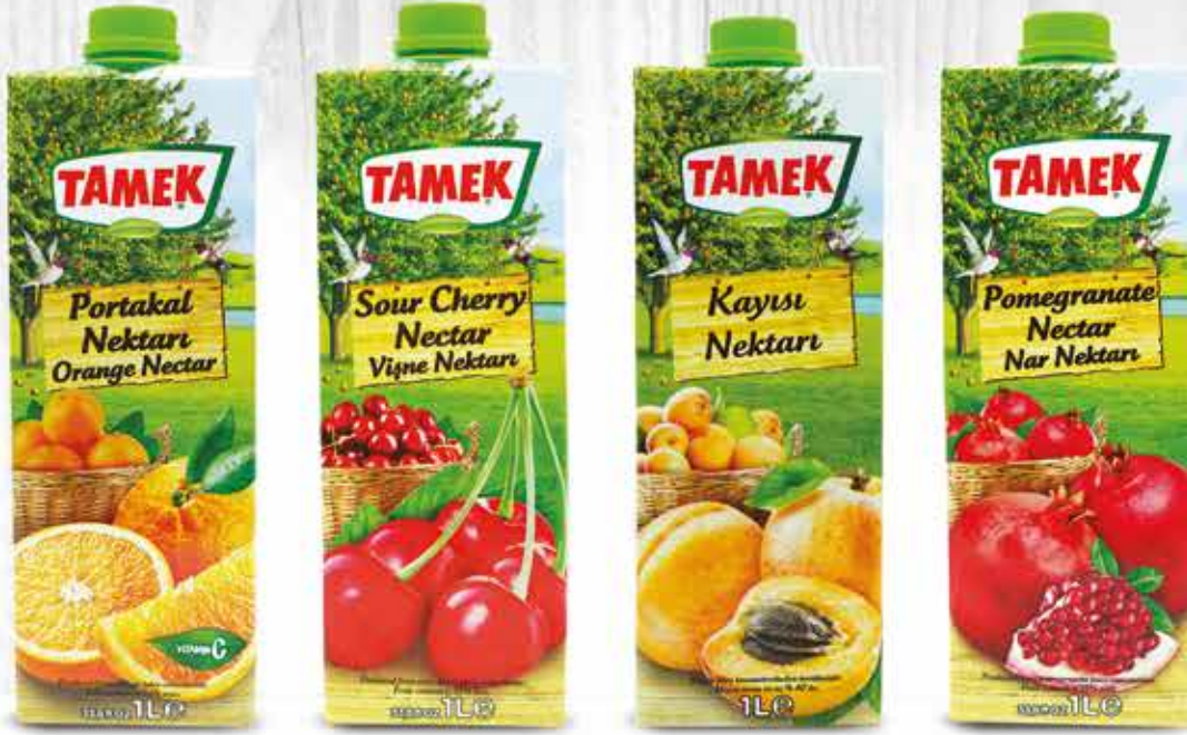
ORANGE NECTAR SOUR CHERRY NECTAR APRICOT NECTAR POMEGRANATE NECTAR