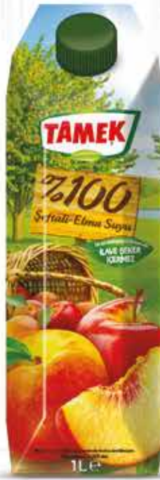
100% PEACH-APPLE JUICE