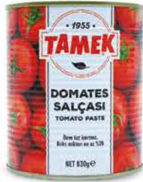
830 g TOMATO PASTE